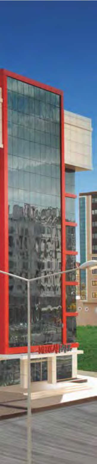
MEDICANA - ANKARA

In the field of direct handling of goods, our expertise lies in placing orders with manufacturers to precisely match production lead times and delivery to our clients. We are able to buffer stock in our own warehousing facility to eliminate chronological differences making us independent of suppliers. In the interests of our clients, we place great value in reducing the storage times of goods in our warehouse to an absolute minimum. This may sound simple, yet in reality the opposite is the case. It requires years of experience, specialized knowledge and the requisite connections. But then, this is the reason we are here.