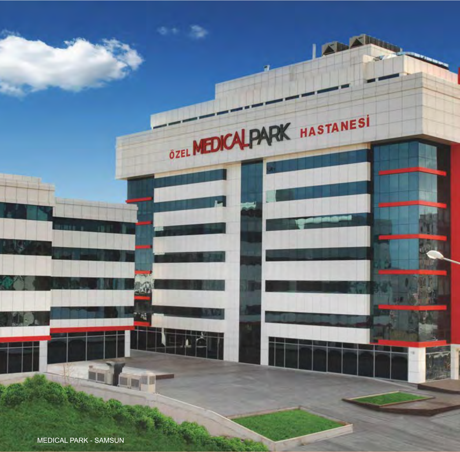
MEDICAL PARK - SAMSUN

The strength of your performance is the partner you choose!